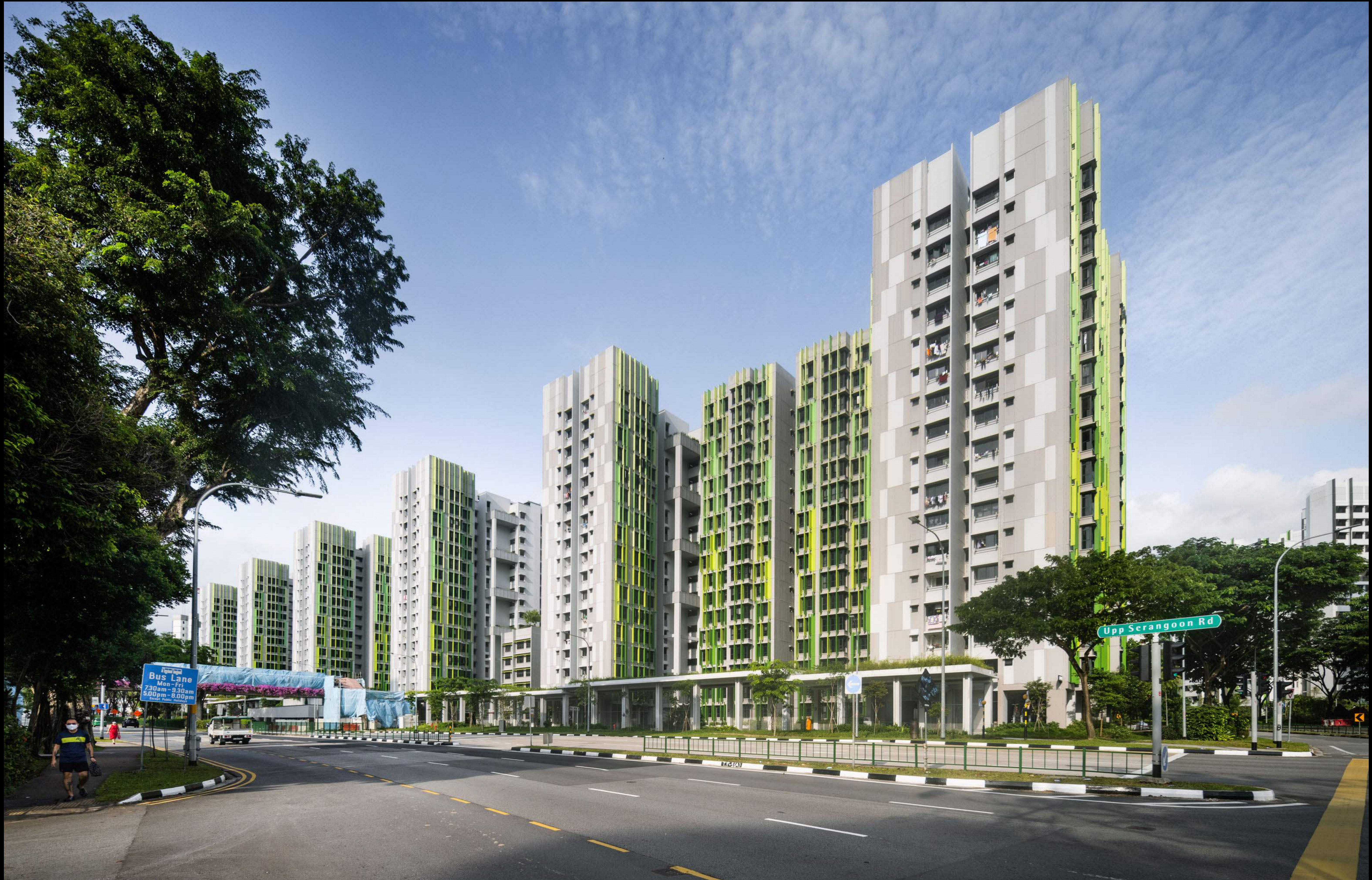
Creating a Greater Sense of Identity – The siting and typology of the housing form addresses the urban edge along the streets, creating a friendlier scale and a hierarchy of public and semi-public spaces