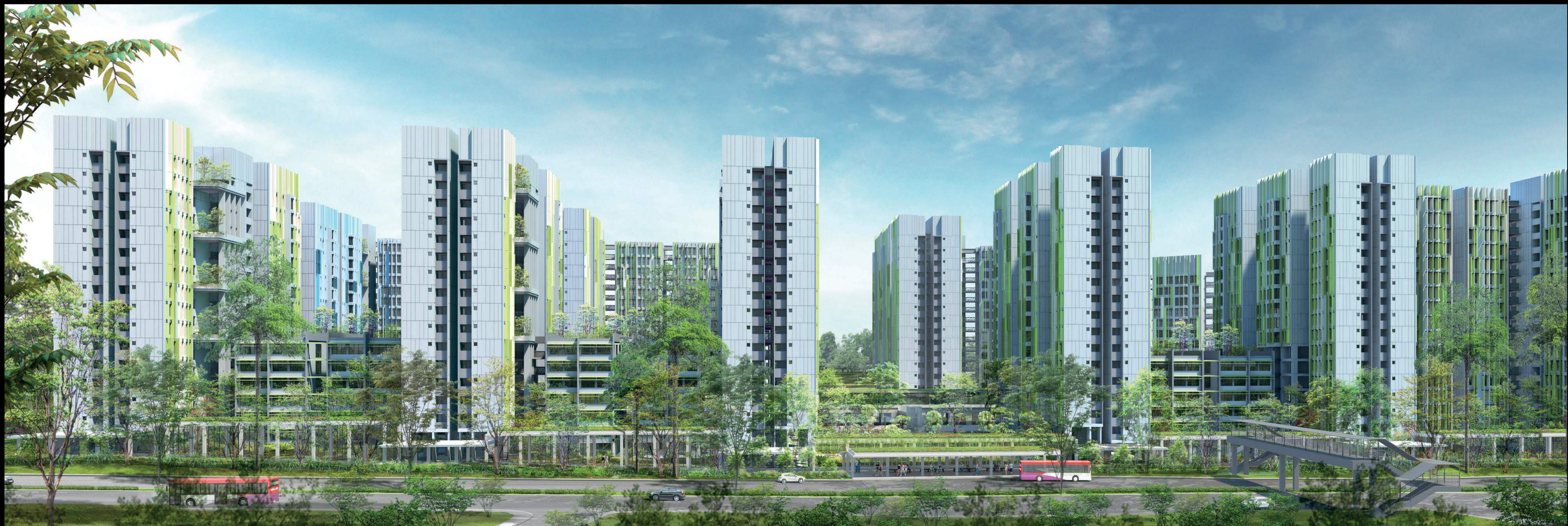
The intent of the elevation design is to create a play of vertical elements through the use of fins and vertical protrusions from the façade. The fins serve not just to accentuate the design but also to provide sunshading