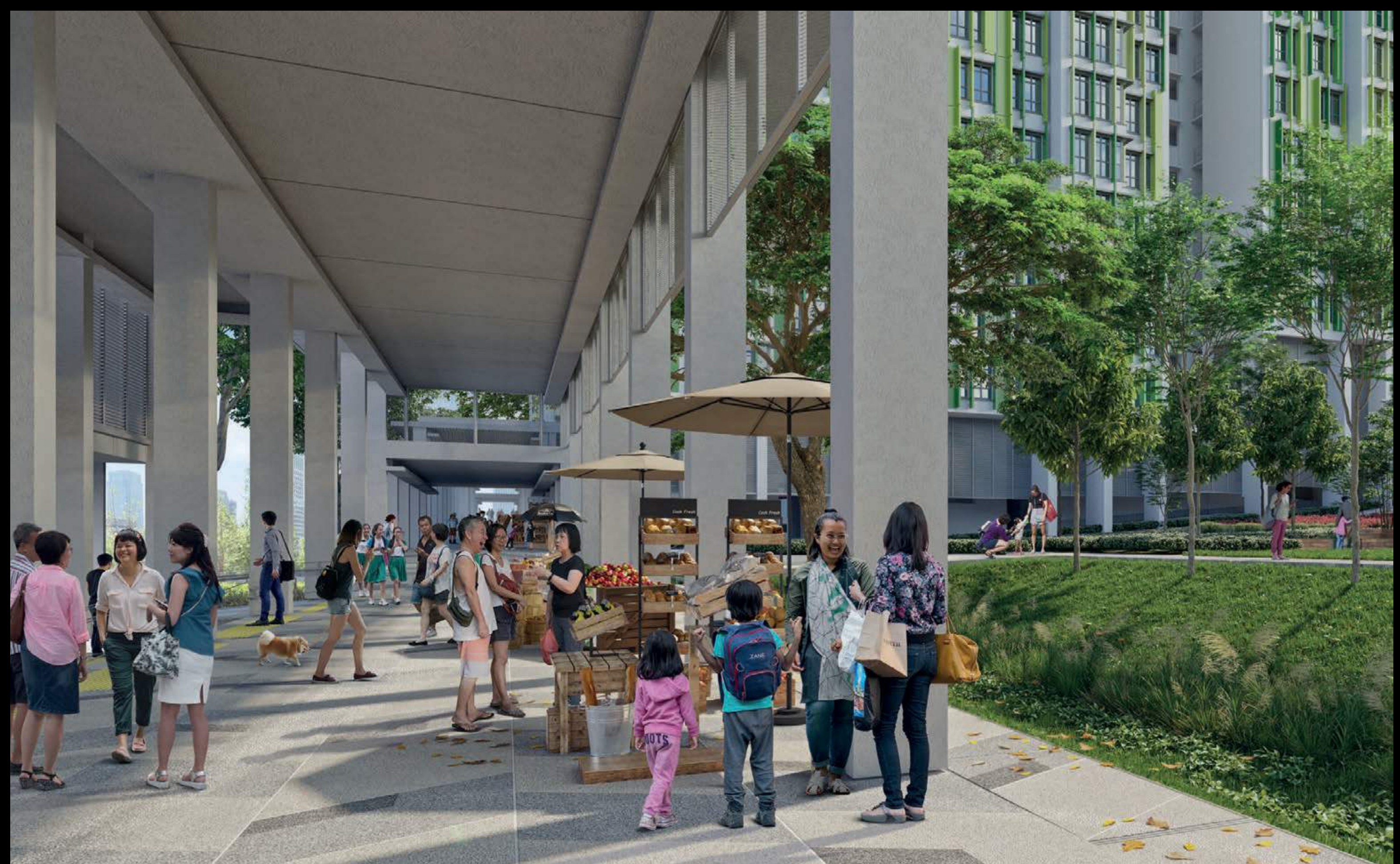
Promoting Resident Interaction – A verandah running the length of Alkaff CourtView along Upper Serangoon Road serves as a community-centric social linkway, allowing for an array of community activities

Another key feature is the expansive roof garden above the multi-storey car park, which links the blocks and provides a lush green respite enjoyed by all residents.